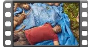
Amhara Ethnic Killed Like Chicken By Oromo Ethnic Militant - Proof 4