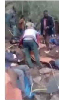
Amhara Ethnic Killed Like Chicken By Oromo Ethnic Militant - Proof 1