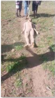
Oromo militants dragged Amhara bodies to instill fear Proof 2