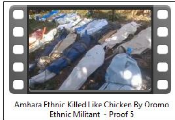
Amhara Ethnic Killed Like Chicken By Oromo Ethnic Militant - Proof 5