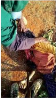
Amhara Ethnic Killed Like Chicken By Oromo Ethnic Militant - Proof 3