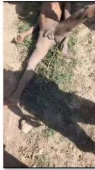
Oromo militants dragged Amhara bodies to instill fear Proof 1