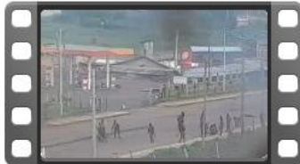
Extrajudicial massacre of Amhara By Oromo Ethnic Lead Government Proof - 1