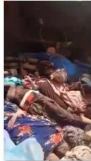
Amhara Ethnic Killed Like Chicken By Oromo Ethnic Militant - Proof 2